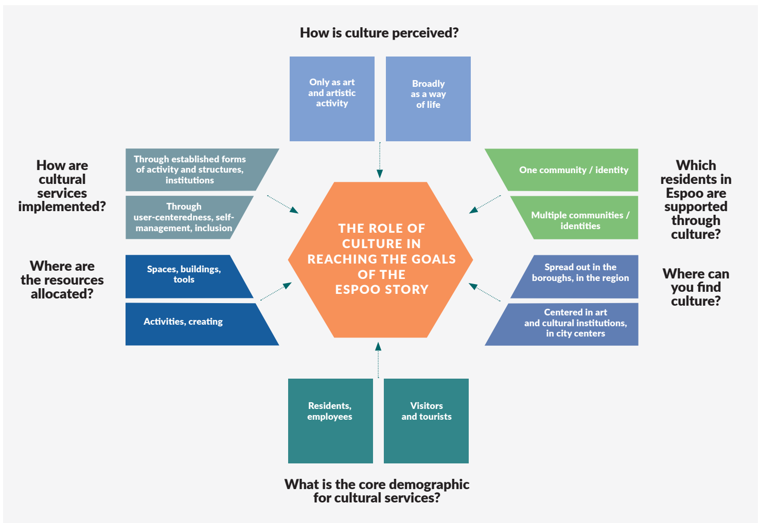
Image 1. City development and culture. 3